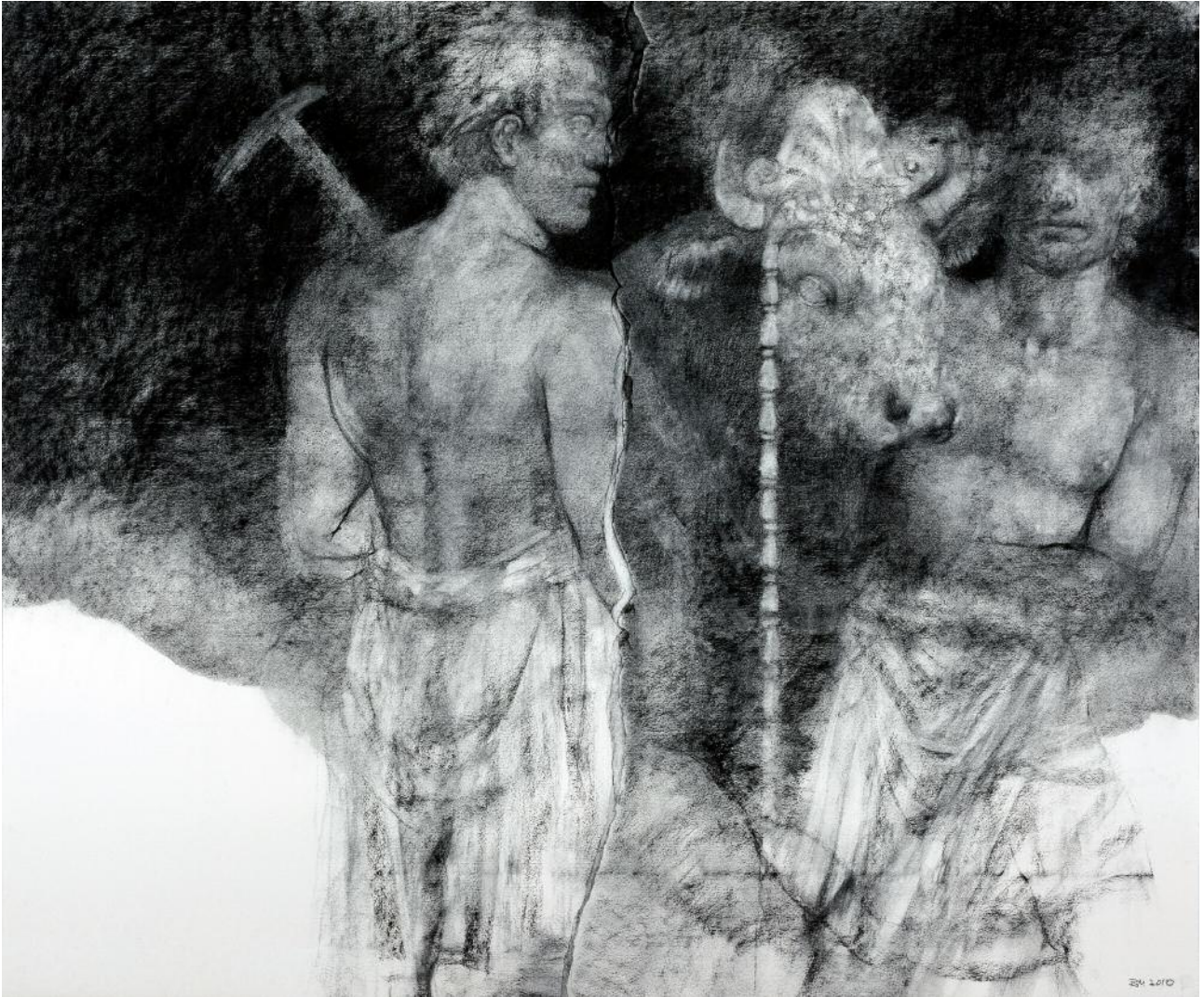
THE SACRIFICIAL BULL (ARA PACIS), 2010 charcoal on paper, 50 × 60 ins (127 × 152 cm)