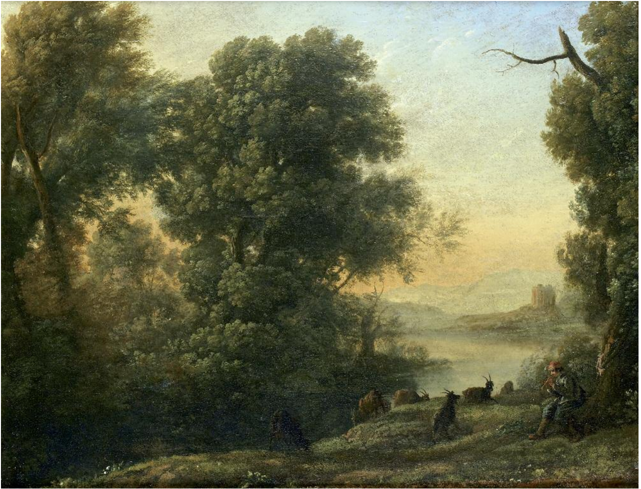
CLAUDE LORRAIN 1604/5–1682 Landscape with a Goatherd , c.1635/6 oil on canvas, 15 × 19 ins (38 × 49 cm)