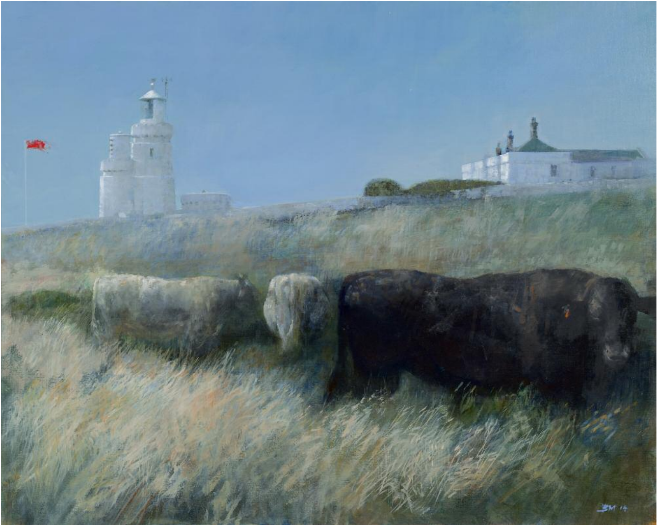
SUMMER CATTLE, 2015 oil on linen, 40 x 50 ins (102 x 127 cm)