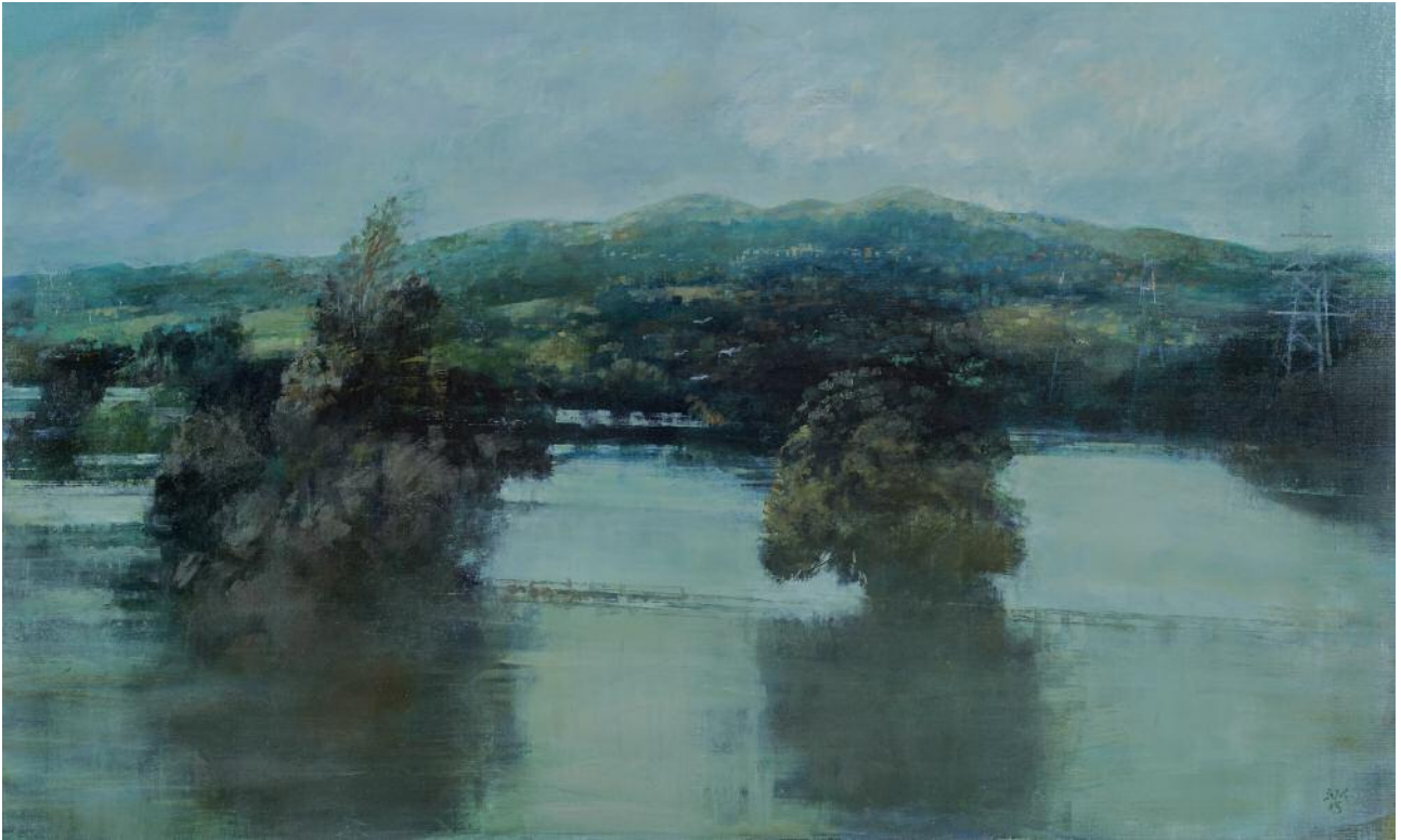
SEPTEMBER FLOOD, 2015 oil on linen, 30 × 50 ins (76 × 127 cm)