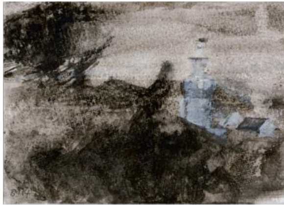
LIGHTHOUSE AND TREE, 2014 sepia/Indian ink, watercolour on paper 4 × 6 ins (10 × 15 cm)