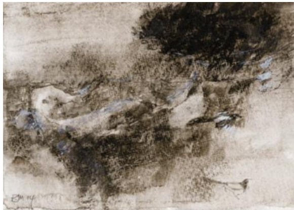
MAGPIES AND TREE, 2014 sepia/Indian ink, watercolour on paper 4 × 6 ins (10 × 15 cm)