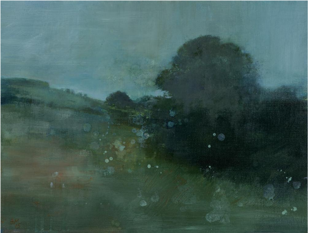
RAINY COUNTRY (GREAT WESTERN) 1, 2015 oil on linen, 18 x 24 ins (46 x 61 cm)