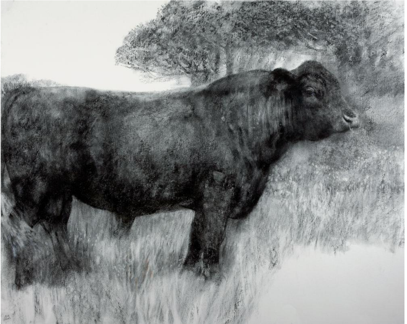
BULL IN A FLOWERING MEADOW , 2010 charcoal on paper, 48 × 60 ins (122 × 152 cm)