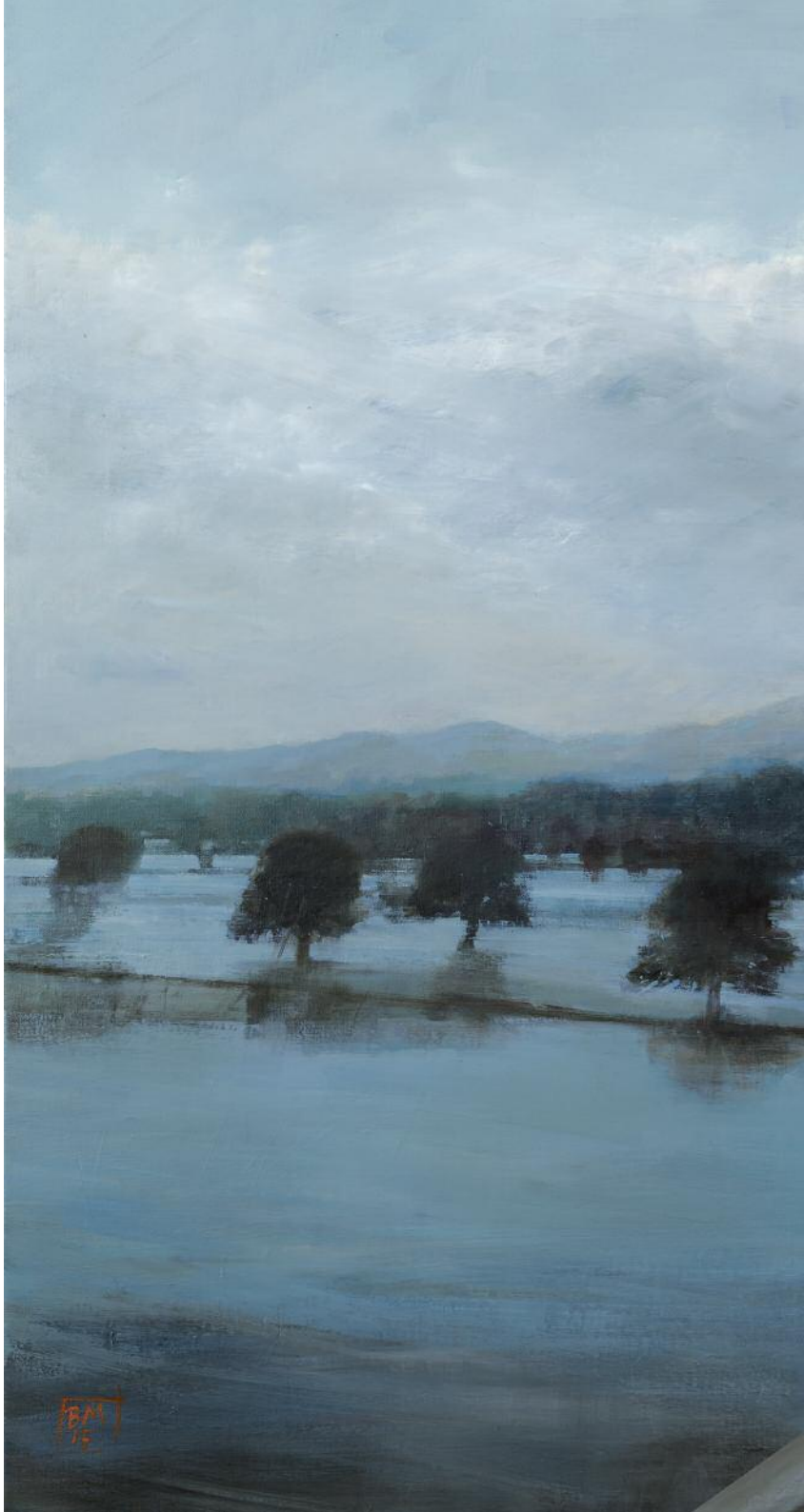
THE BRIDGE ACROSS THE FLOODED RIVER, 2015 oil on linen, 40 × 60 ins (102 × 152 cm)