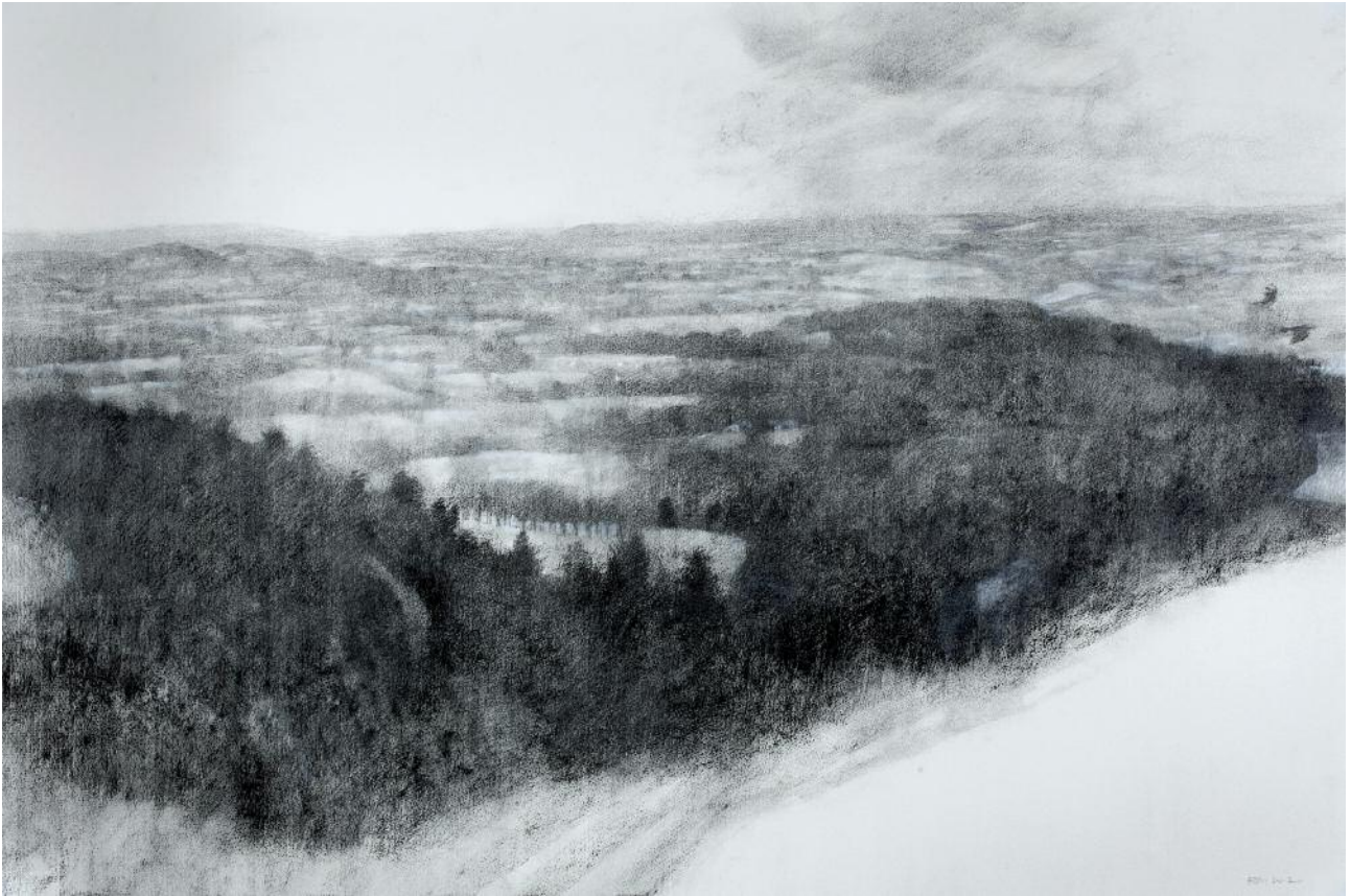
SNOWY WOODS, 2012 charcoal and graphite, 32 x 48 ins (81 x 122 cm)