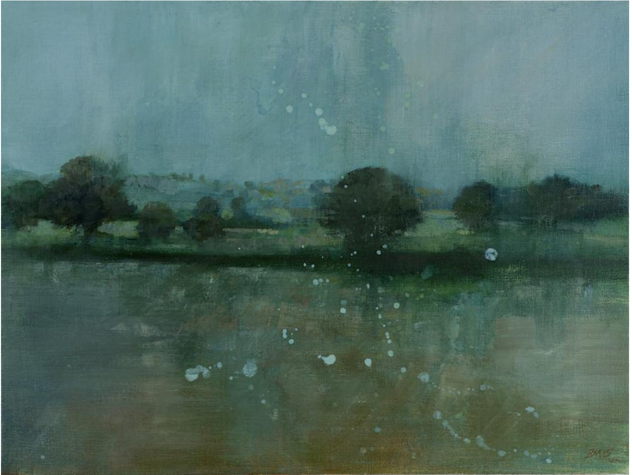
RAINY COUNTRY (GREAT WESTERN) 2, 2015 oil on linen, 18 x 24 ins (46 x 61 cm)