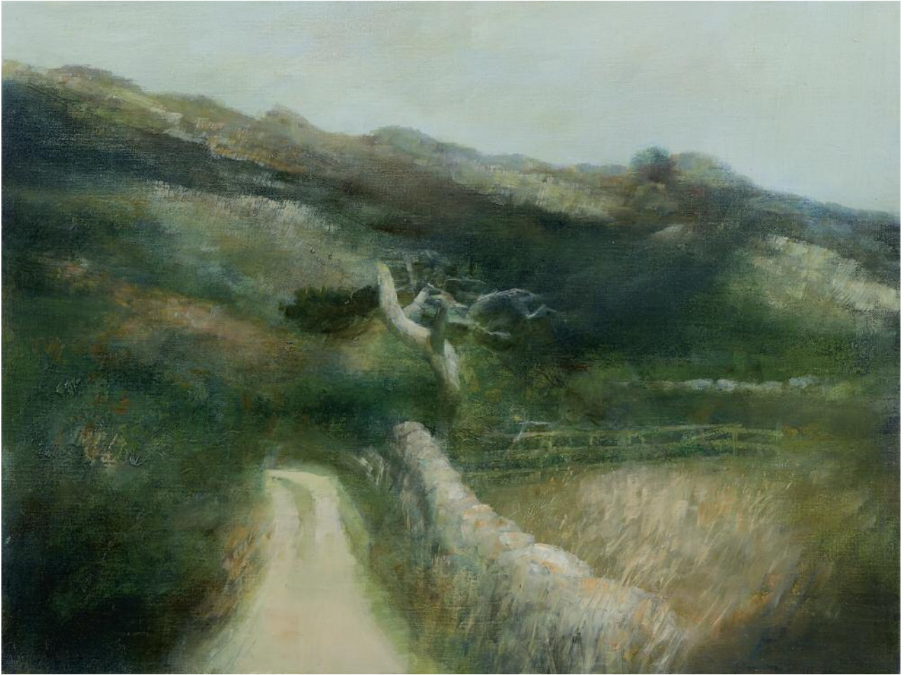
LANDSCAPE WITH A PINE TREE, 2014 oil on linen, 18 x 24 ins (46 x 61 cm)