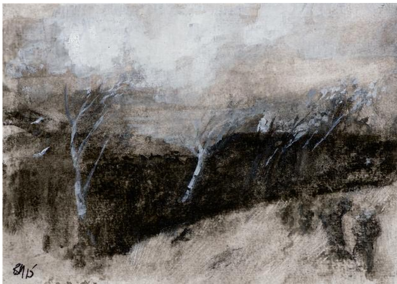
STUDY AFTER SAMUEL PALMER'S 'THE WHITE CLOUD', 2015 sepia/Indian ink and watercolour on paper 4 × 6 ins (10 × 15 cm)

Samuel Palmer (1805–81), The Bright Cloud , 1834, oil and tempera on mahogany panel, 9 × 12½ ins (23 × 32 cm)