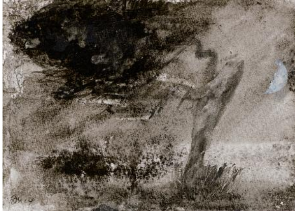
TREE AND MOON, 2014 sepia/Indian ink, watercolour on paper 4 × 6 ins (10 × 15 cm)