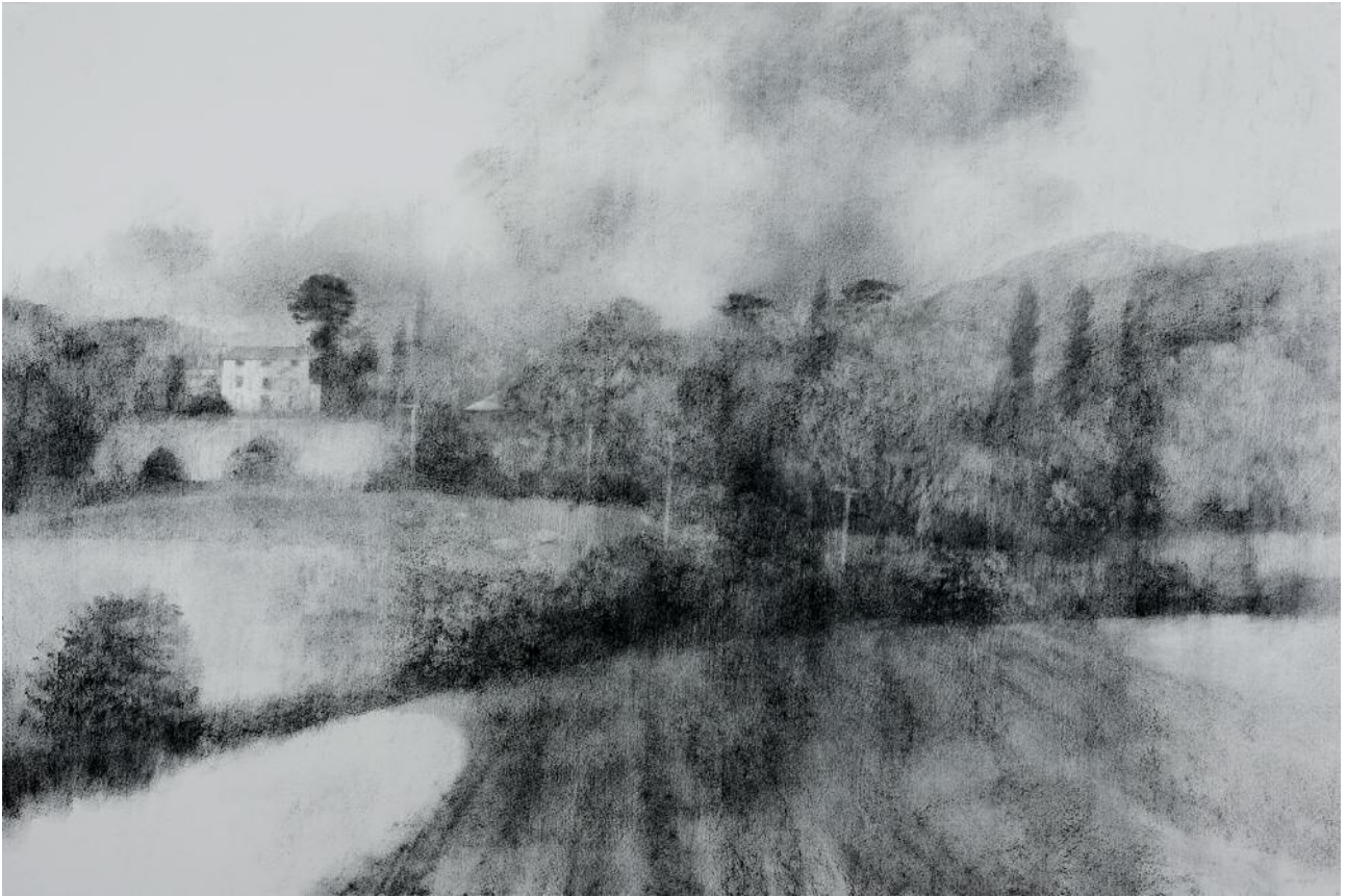
SPRING LANDSCAPE, 2012 charcoal and graphite on paper, 32 × 48 ins (81 × 122 cm)